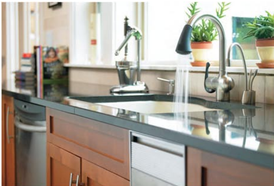
Above: A Grohe faucet is an elegant choice; Below (left): A conveniently placed wine fridge in the island is perfect for entertaining; Below (right): The homeowners enjoy cooking so the Wolfe cooktop was a must-have.